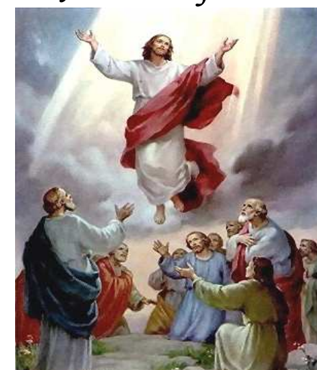
The Ascension of Our Lord

We have been invited to an open day on Sunday 1 st June 2014 from 10am to 4pm at the Market house; they are celebrating the refurbishment of the lovely building as well as remembering the history of the building over the last 355 years. At 11am and 2.30pm there will be a talk on the past, present and future of the Markey House. Please join us if you can.